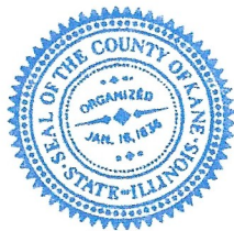
County Clerk, The County of Kane, Illinois